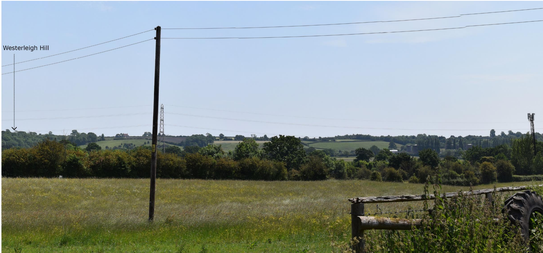
Figure 8.3: View of the Pucklechurch Ridge from Westerleigh Road